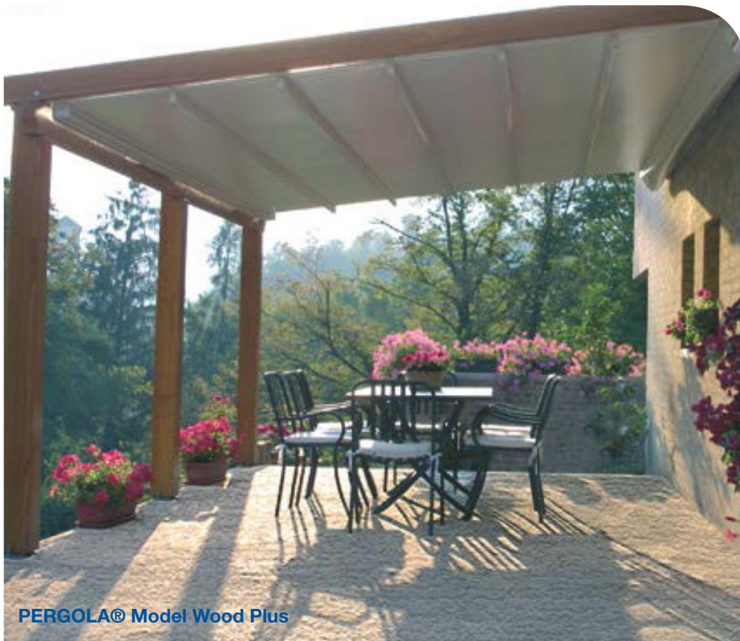
PERGOLA® Model Wood Plus

All Pergola® models are custom built to fit each area. The fabric is manufactured in one piece, even on wider awnings to prevent water leaking. Wider units therefore have multiple framing supports added to ensure a strong framework. Multiple units can also be mounted together with a gutter system in between for even wider widths. An integrated guttering system avoids water leakage.