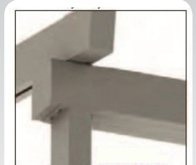
with Tecnic Profile